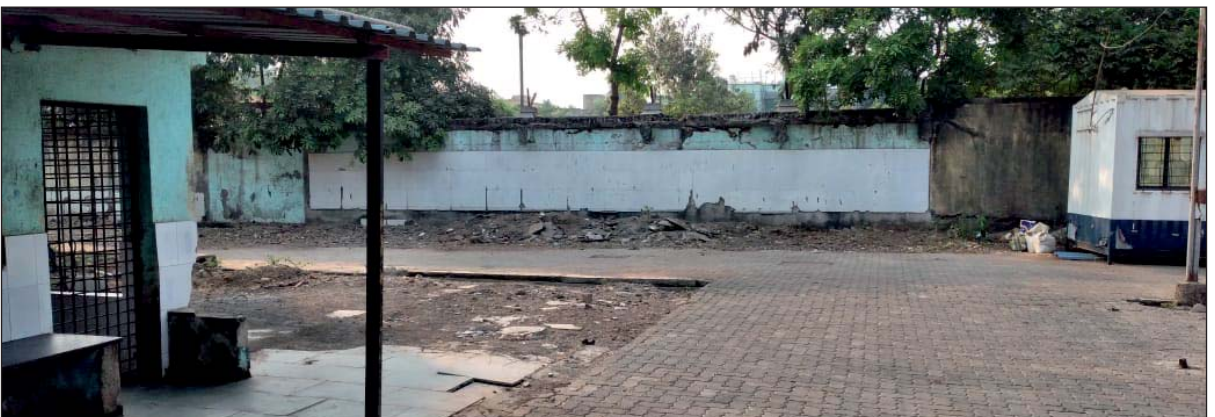
Kennels demolished by MCGM including the all important Isolation Ward