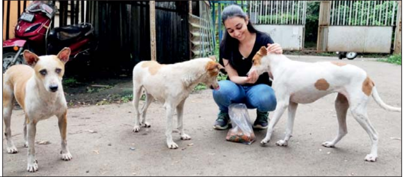
IDA Indievets in action